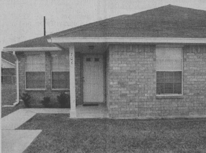
Included is stove, refrigerator, dishwasher, central A/C and heating, large yards, washer/dryer hookups. Won't Last. Call Now. 979-758-1295

APARTMENT FOR RENT PLUSH SPACIOUS 2&3 BD $550 - $650